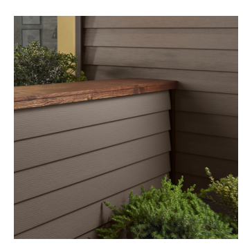
Ply Gem Steel Siding