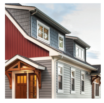
Vinyl Siding and Accent Panels

Ply Gem has all the accessories and details you need to complete your project, including corners, trim, guttering, soffits, door surrounds and fascia. Ply Gem is a division of Cornerstone Building Brands, the nation's leading exterior building products company. As a result, we can provide you with a wide range of enhancements that complement Ply Gem products – Ply Gem gutter protection, Ply Gem Steel Siding, Ply Gem Trim and Mouldings, and Ply Gem Shutters and Accents. They all work together so that you can have worry-free maintenance and beauty down to the last detail.