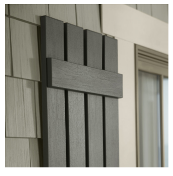
Ply Gem Shutters and Accents