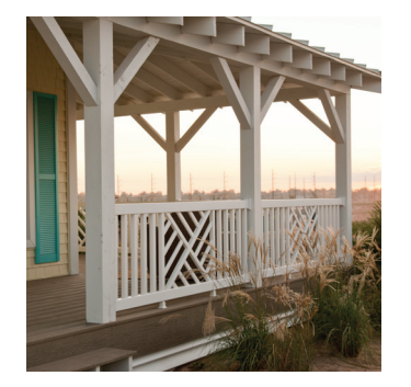
Ply Gem Fence and Railing