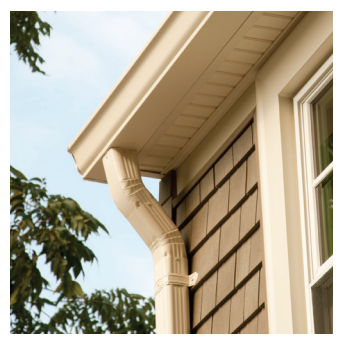
Rainware, Fascia, Soffit